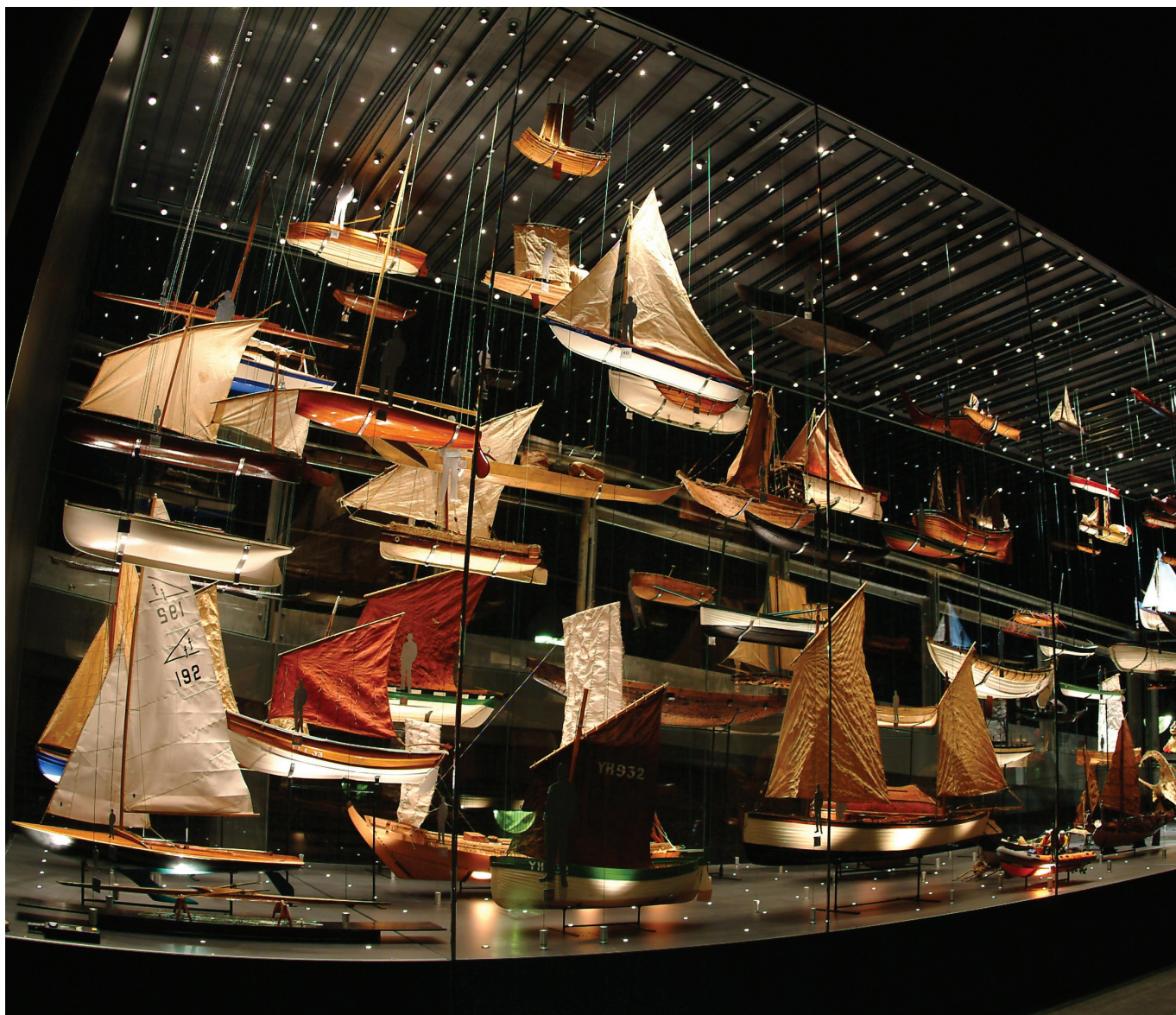
Project National Maritime Museum, Falmouth Design Land Design Studio