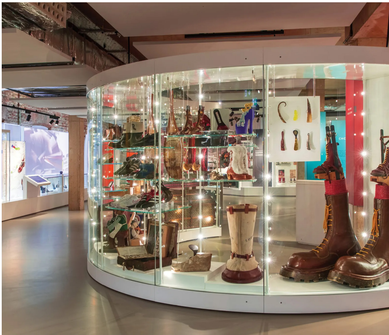
Project Northampton Museum & Art Gallery Design Design Creative Goods