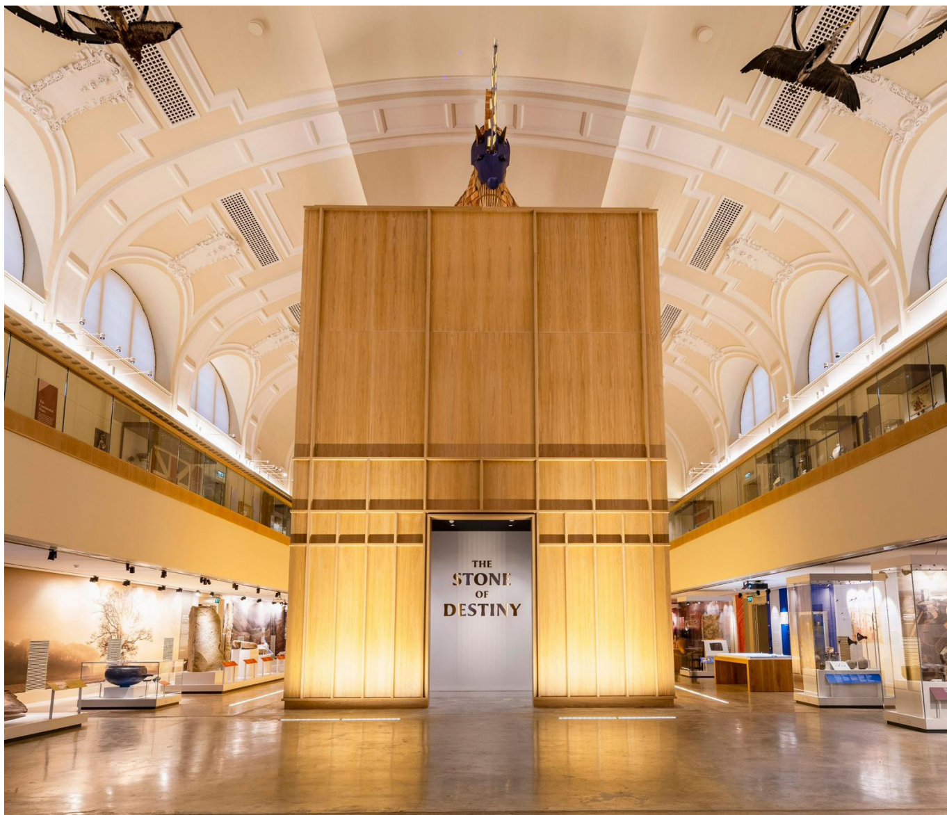
Project Perth Museum Design Metaphor