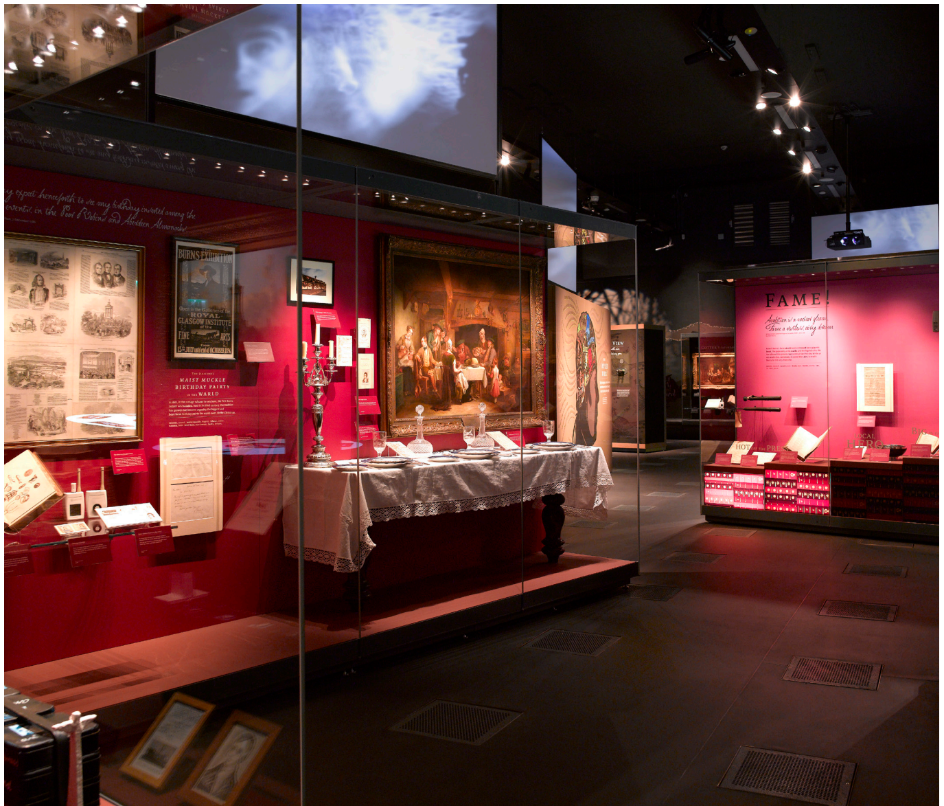
Project Robert Burns Birthplace Museum Design Event Communications