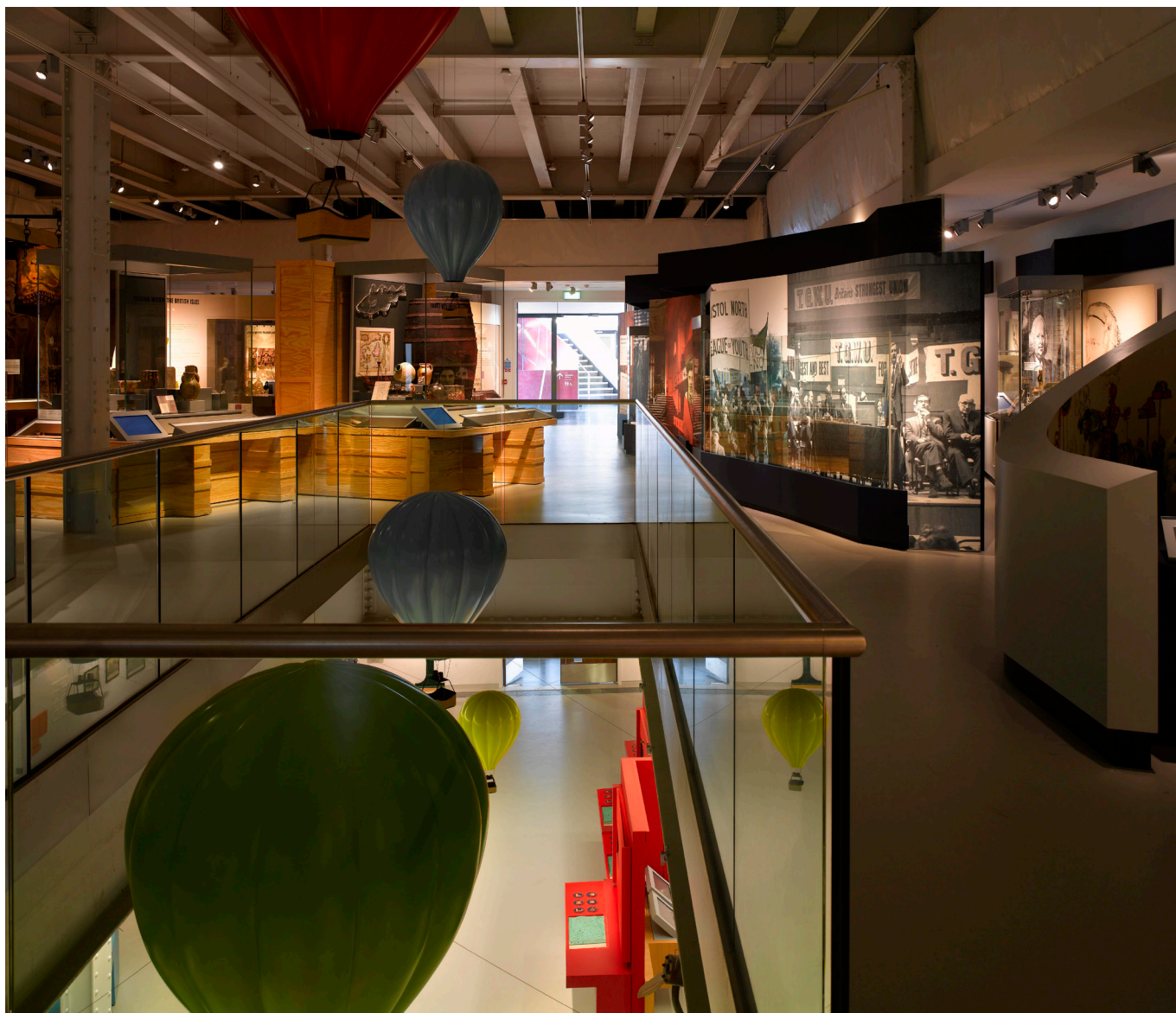
Project M Shed Design Event Communications