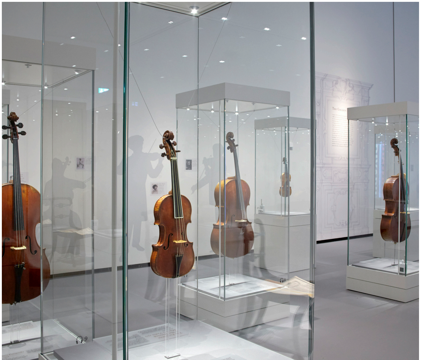
Project Ashmolean Museum Design Ashmolean Museum / University of Oxford