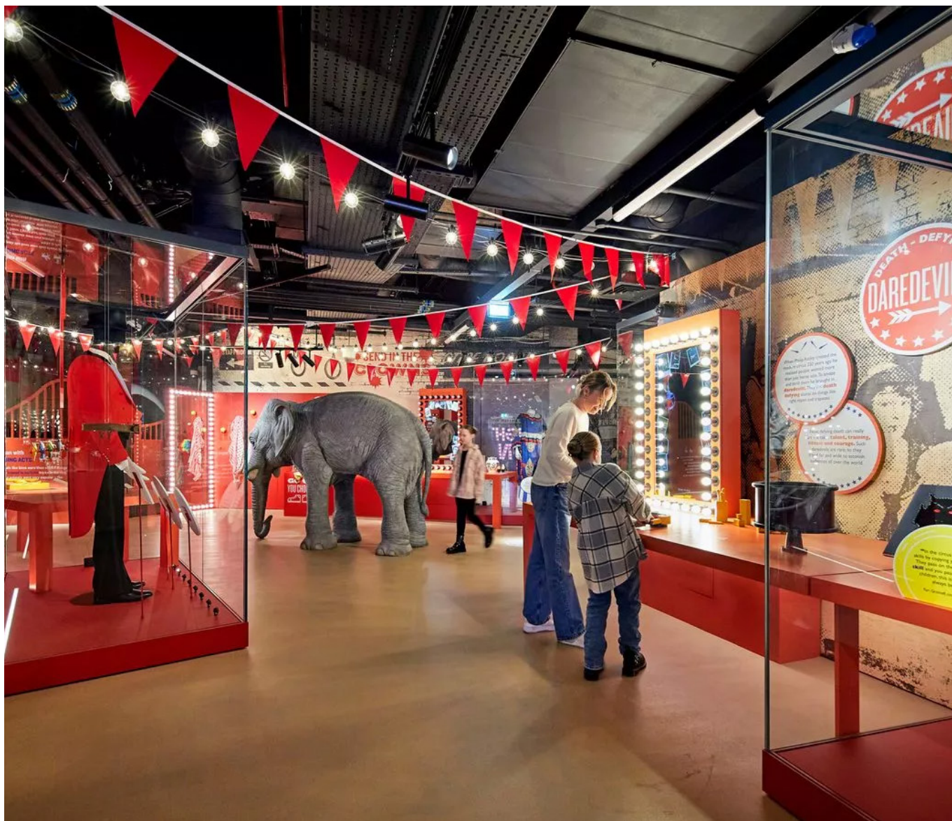
Project Showtown Entertainment Museum Design Casson Mann