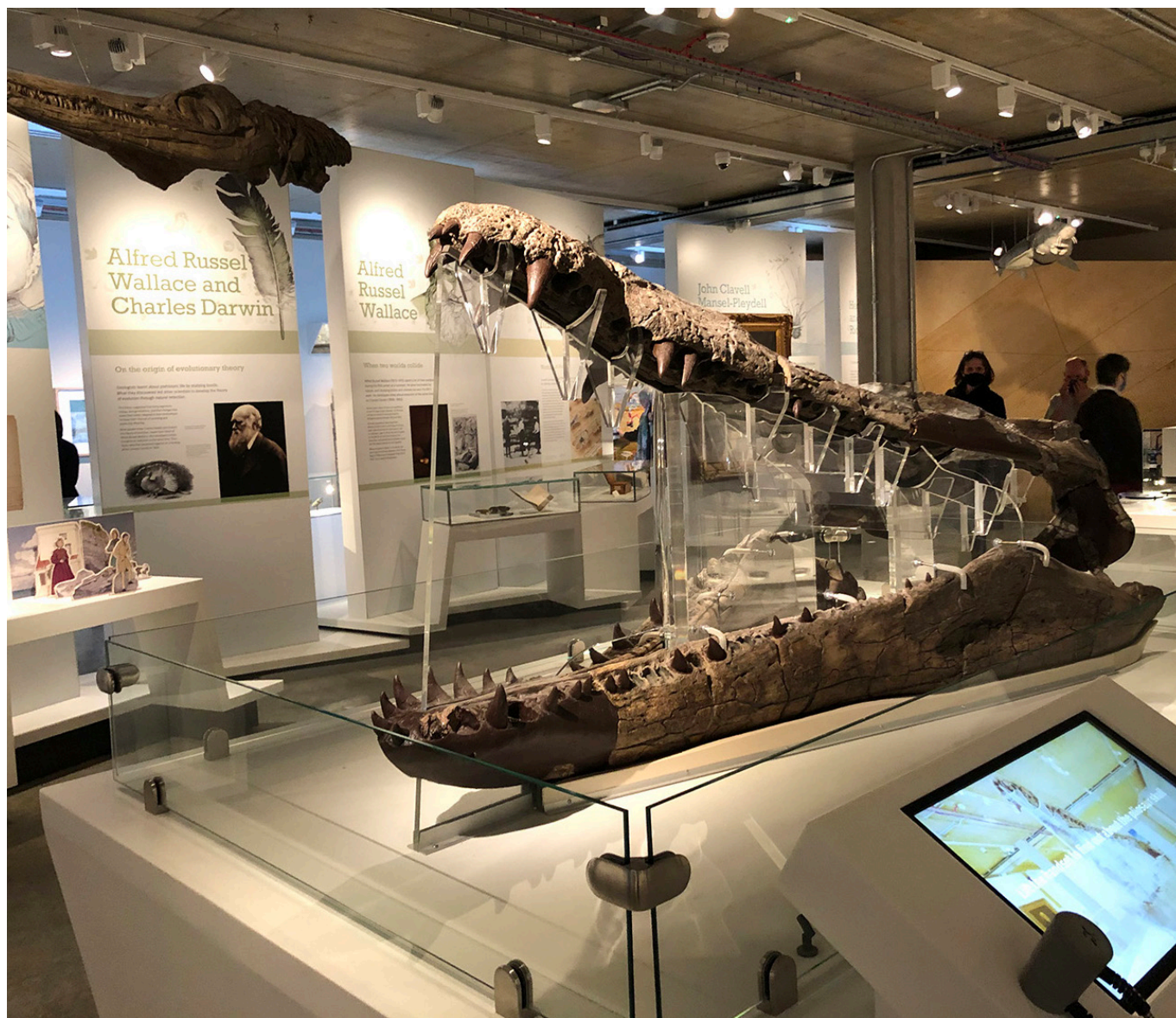
Project Dorset Museum Design Real Studios