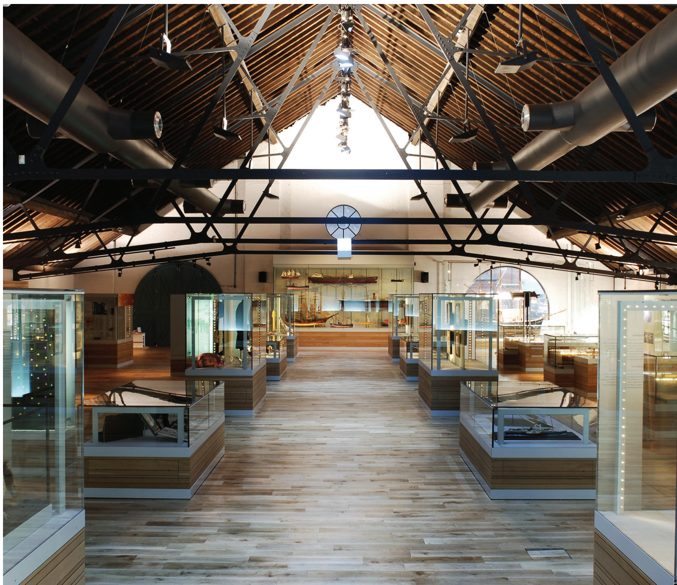
Project National Maritime Museum, Swansea Design Land Design Studio