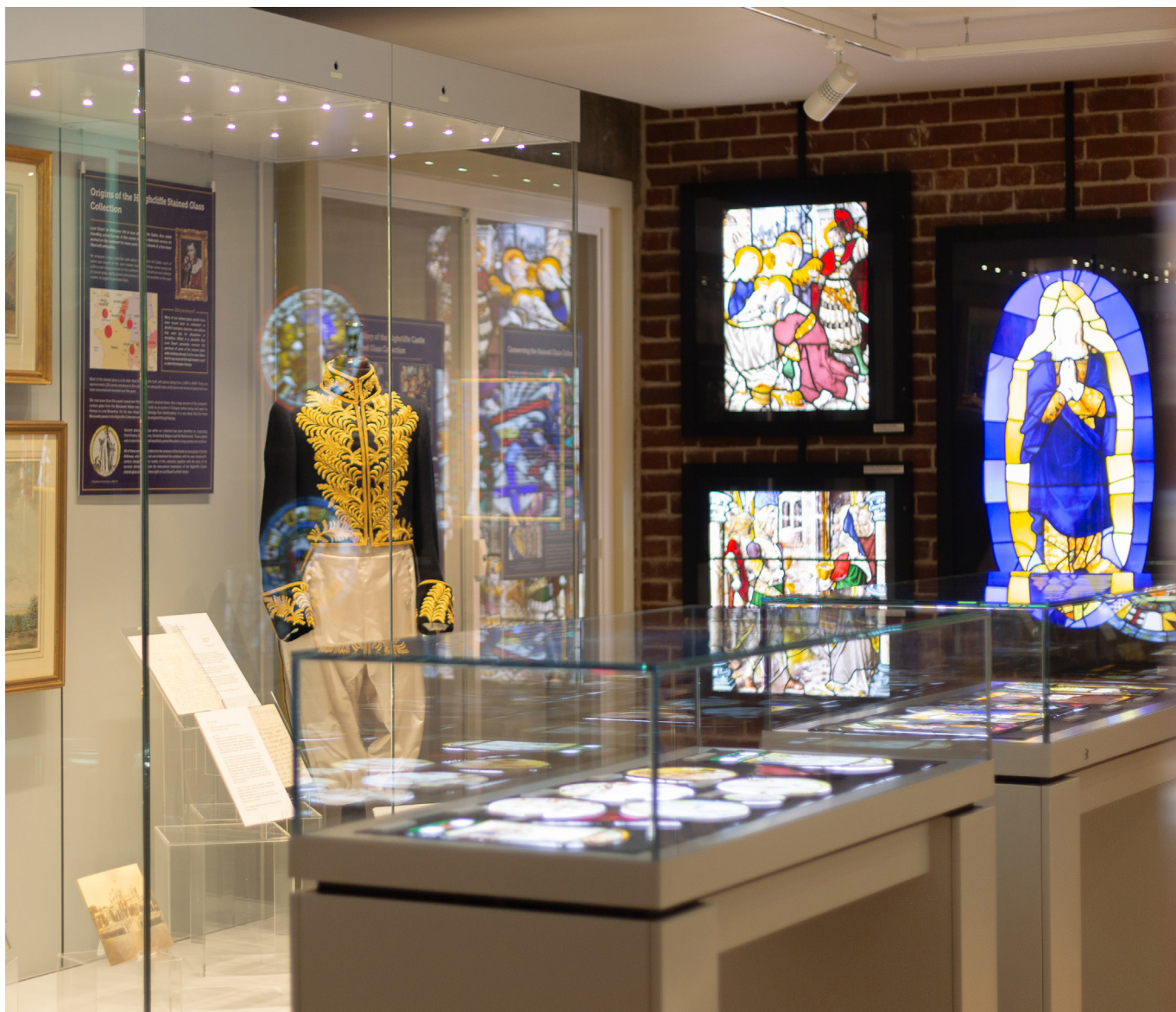
Project Highcliffe Castle Design Highcliffe Castle